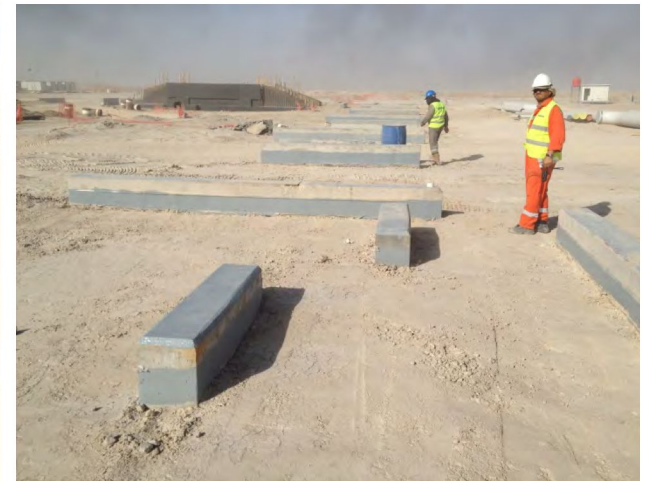
CPF – Piping Installation on Sleepers and in Piperacks