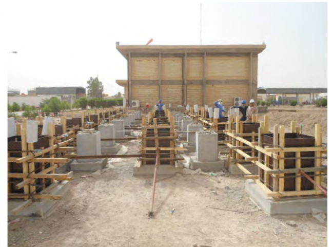
DS1 – Pipe Installation and Foundation Installation