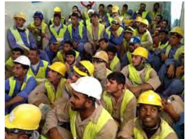
CPF – Celebrations at CPF on 06-JUNE