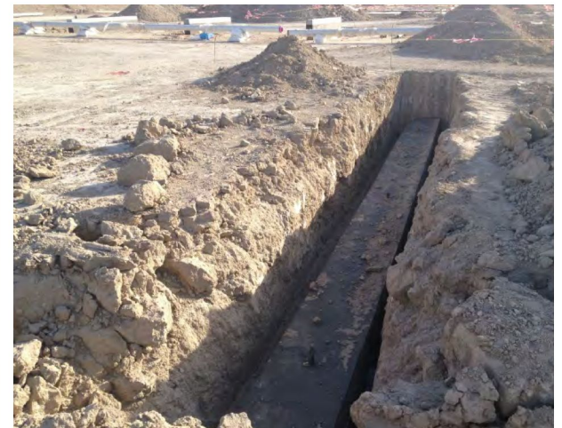
DS2 – Piping Installation, Sleeper Installation and Duct Banks