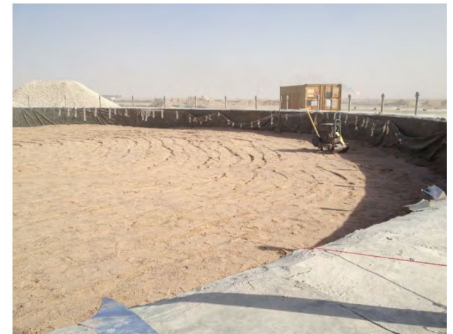
CPF – Wash Water Tank Base; Potable Water Tank Installed; Raw Water Tank Base; Produced Water Tank Base; Buffer Tank Base