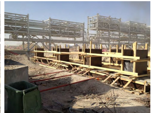
CPF – Hot Oil Heater Foundation; Hot Oil Heater Pipe Rack Foundations