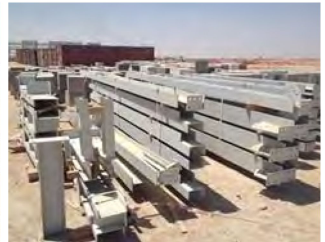
CPF – Installation of Structural Steel and Erection of Packaged Equipment Ladders and Platforms