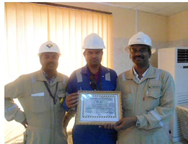
DS1 – Celebrations at DS1 on 06-JUNE