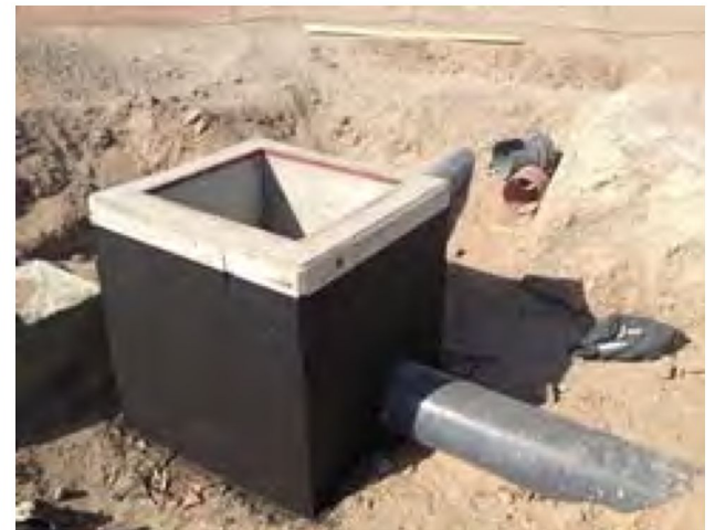
CPF – Various Catch Pits and Underground Piping for Storm Water