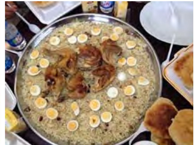
CPF – Celebrations at various Contractors camps on 06-JUNE