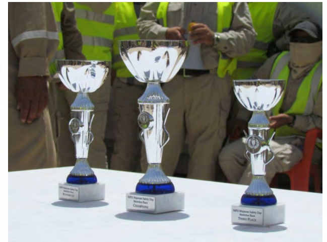
ERW – Celebrations on 06-JUNE