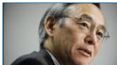
哥本哈根峰会:朱棣文称美国在清洁能源领域落后