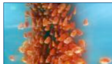
图片频道:路透11月照片精选(下)