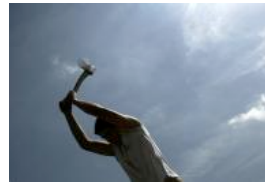
Getting the axe: Shell said to plan cuts in exploration unit.