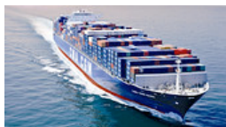
New Generation of Ocean Behemoths