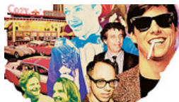
New Jersey: Hidden State of Culture