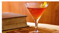
A Birthday Toast to Scotland's Bard