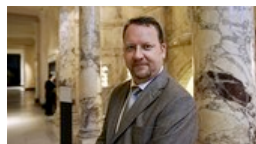
Book Lover: Revisiting the Recent Past