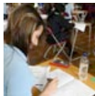
Boy dressed as girl to cheat on exam