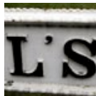
Council bans apostrophes on signs