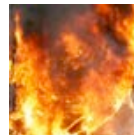
Fire station burns down