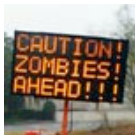
Road signs hacked to warn of zombies