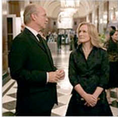
Suspenseful Corporate Litigation Returns