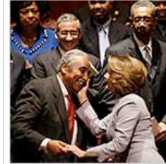
Congressional Black Caucus Assesses Its Role