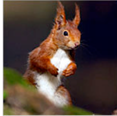
Saving a Squirrel by Eating One