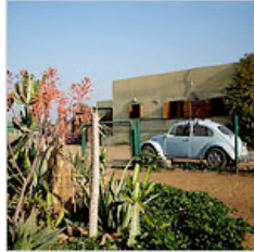
In Egypt, Living on a Farm