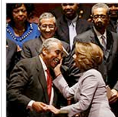
Congressional Black Caucus Assesses Its Role