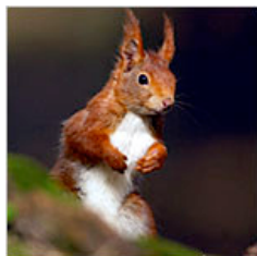
Saving a Squirrel by Eating One