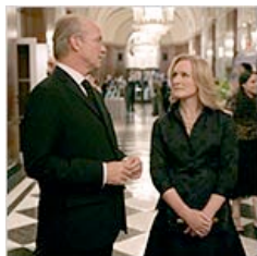
Suspenseful Corporate Litigation Returns