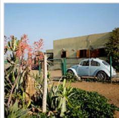
In Egypt, Living on a Farm