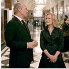
Suspenseful Corporate Litigation Returns