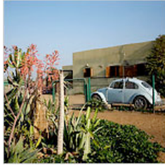
In Egypt, Living on a Farm