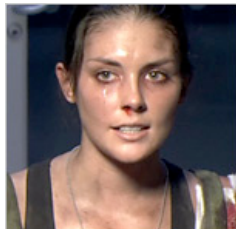
NBC Bridges Series Gaps With Online Minidramas