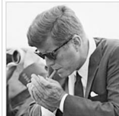
Lessons for Others in Obama's Efforts to Quit