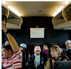
On the Outlet-Mall Bus, Checking Retail's Pulse