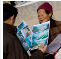
Romance Amid Chinese Quake Recovery Effort